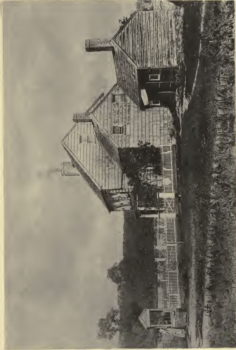
WALT WHITMAN'S BIRTHPLACE WEST HILLS, LONG ISLAND.